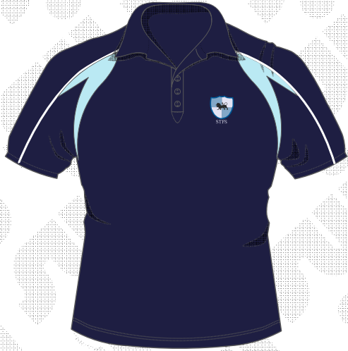
Vapour Polo: Mixed