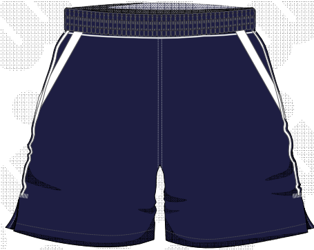
Cuatro Shorts: Mixed