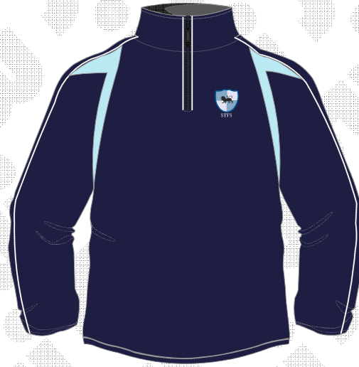
Cuatro Fleece: Girls