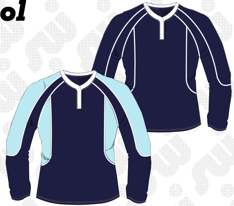
Pro-Tec Rugby Shirt: Boys